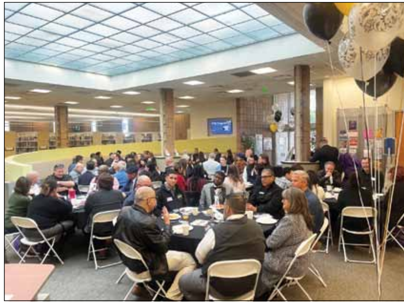
Attendees enjoy breakfast during the roundtable questions.