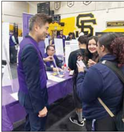
RIGHT — Mentors, mentees, and Santa Fe High School staff