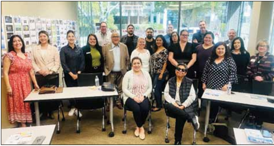
Cheers to the newest members of the SFS Chamber family!