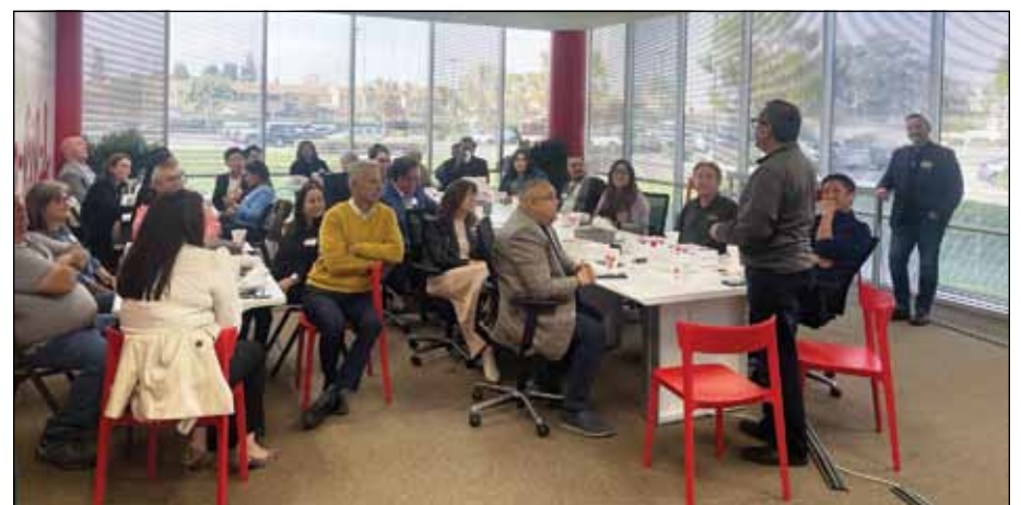
Attendees make connections at the February Networking at Noon.