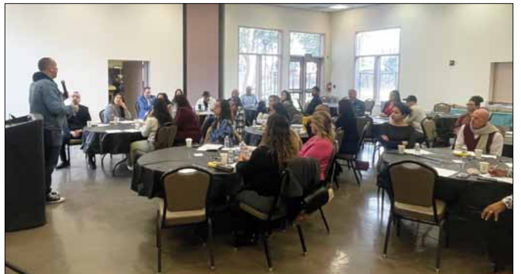
Attendees hear about leads groups plans for the coming year.

For more information on upcoming Leads events and opportunities, visit www.sfschamber.com or contact the Santa Fe Springs Chamber of Commerce.