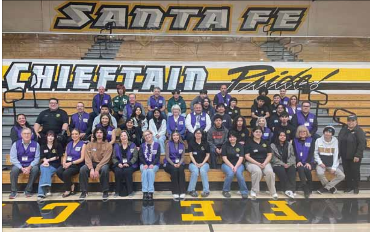
Mentors and mentees in the program gather for a photo.