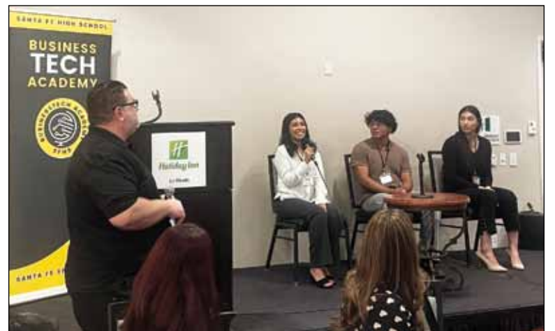
Guest speaker panel answers questions.

By collaborating with American First Credit Union, the Youth Enrichment Fund Mentor Program continues to equip young minds with practical skills that will serve them well beyond the classroom.