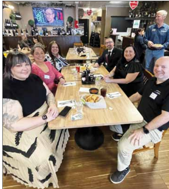
Chamber members and potential members gather to meet, greet, and eat!