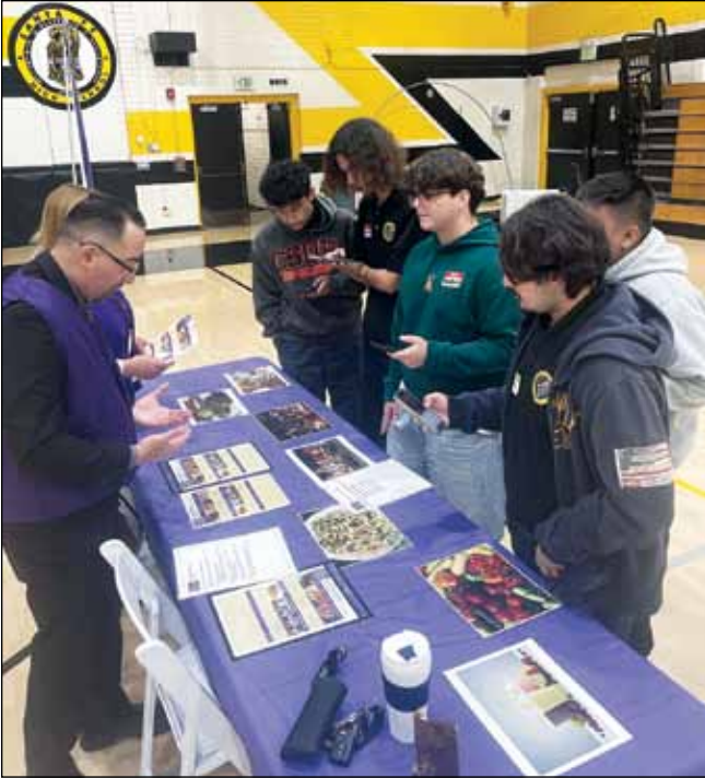
Taking a bite out of reality, students navigate their expenses at the food and grocery station.