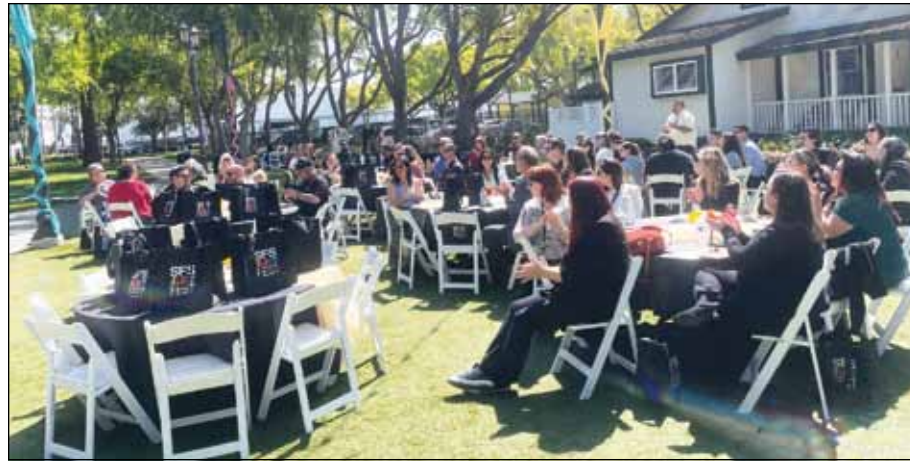
Heritage Park full of guests engaged in guest speakers while enjoying the ambiance.