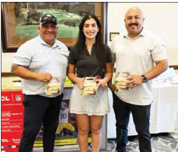
First Place Winners - Tangram Interiors