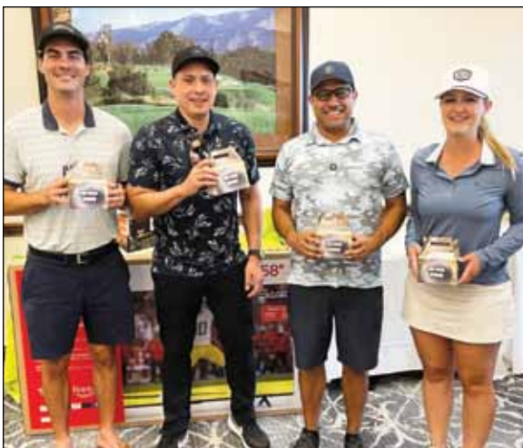
Second Place Winners - FFB Bank