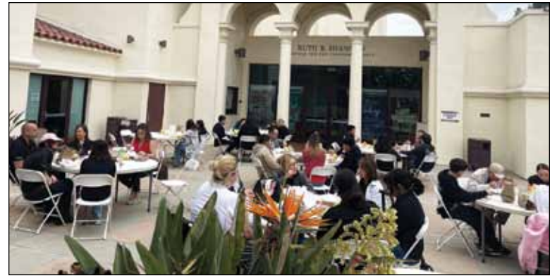
Mentors with their mentees enjoy a hearty lunch out on the patio of the Ruth B. Shannon Center.