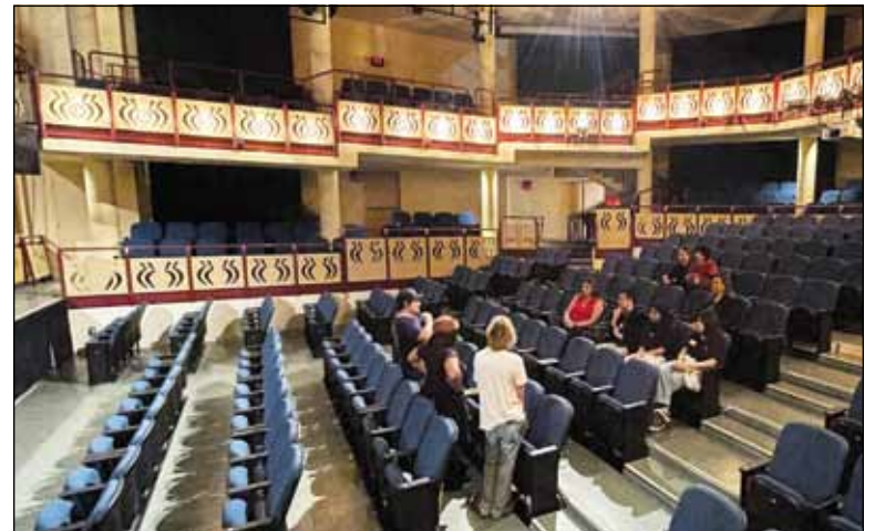
One of four groups listening to college students at a Q&A session.