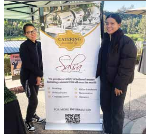
Breakfast burritos from Zapien's Salsa Grill