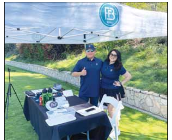
Tee Sponsor FFB Bank