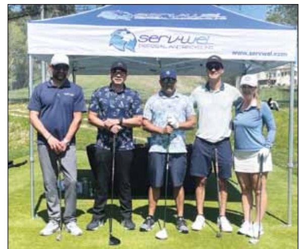
Tee Sponsor Serv-Wel Disposal & Recycling