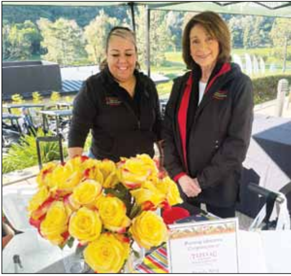
Morning libations from Tepeyac Restaurant