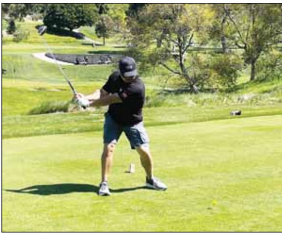
Beautiful day out on the green!