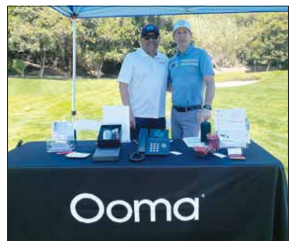
Tee Sponsor Ooma