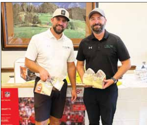
Third Place Winners - LSL CPAs & Advisors