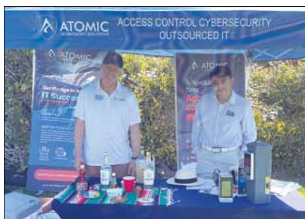
Tee sponsor Atomic Technology Solutions