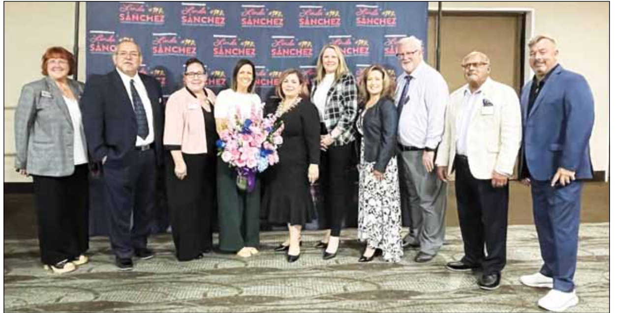
Congresswoman Linda Sánchez (center) with chambers of commerce representatives.

She emphasized that Congress holds constitutional power over federal spending, and decisions being made today will have lasting effects on both