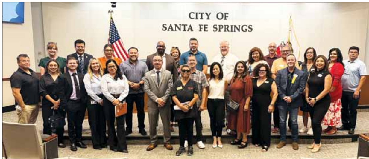
Santa Fe Springs Chamber and city representatives welcome our newest members.