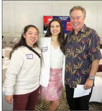
Chamber members pause for a photo during the networking game.

Thank you to Azar Event Center staff for your amazing attention to detail. A beautiful place for your next meeting, party, or event.